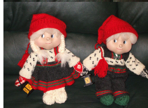
All the wonderful things sold for the Lodge!!