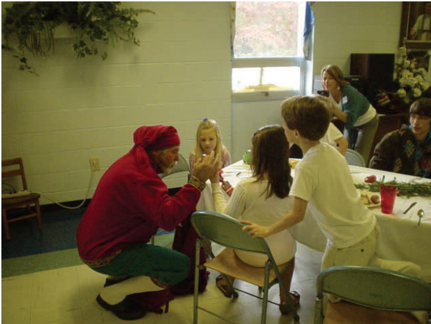
SOUTHERN STAR JULETREFEST 2009