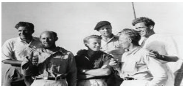
THE CREW OF THE KON-TIKI